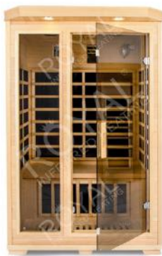
Balnera S2 1-2 persons 1.86kW