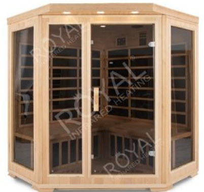
Balnera S4 3-4 persons