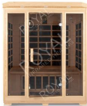
Balnera S3 2-3 persons