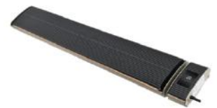
VELIT SOL 1800W