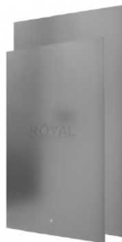
REPULSUS 350W & 500W