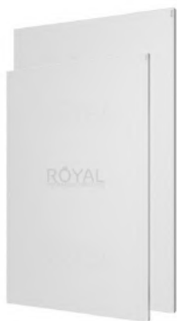
DOMUS 580W & 900W