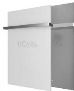
LINTEUM 580W & 350W(S)